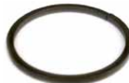
Shimano Part # FW7030

Also available from Smalley Steel Ring Company.