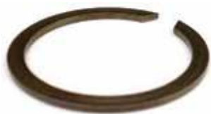
Gates Part # SR144

Gates requires a retaining ring replacement for the standard Shimano Retaining Ring part #FW7030 for some Alfine and Nexus applications due to the dimensional differences between rear sprockets. The replacement Gates retaining ring is part #SR144. See the table below to determine when to use the Gates Carbon Drive retaining ring vs. the stock Shimano retaining ring.