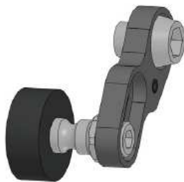
Illustration 4: Without spacer